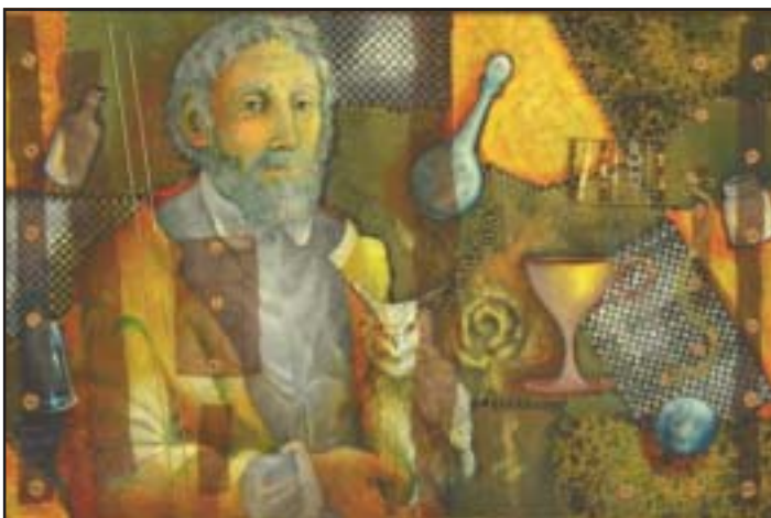
(Above) "Knowledge Seeker" by Sibyl MacKenzie

Below: from Hooker's "Images of Blue Ridge Country"